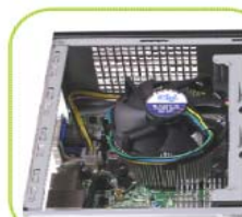
57mm KOZ Illustration

chassis build in Intel DQ45EK with Intel boxed Core 2 Duo Processor (TDP 65W)